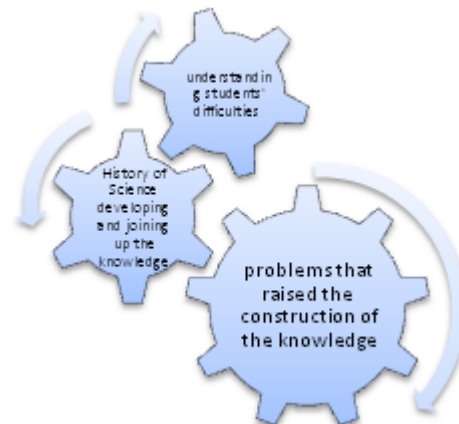
FIGURE 1. Some parts in teacher's knowledge.

1- Knowing the problems that raised the construction of the knowledge to be taught, without which, knowledge seems to have been built up arbitrarily. Knowing the History of Science, not only as a basic aspect of scientific culture, but ultimately, as a means of associating scientific knowledge with the problems that led to the building up of this knowledge. Above all, knowing what difficulties were faced in the building up of this knowledge; the epistemological obstacles involved; since this knowledge constitutes an essential aid to understanding students' difficulties, knowing as well how this knowledge developed and how the various points came to be joined up into one consistent body of knowledge, and, consequently, avoiding static and dogmatic views that distort the very nature of scientific work.